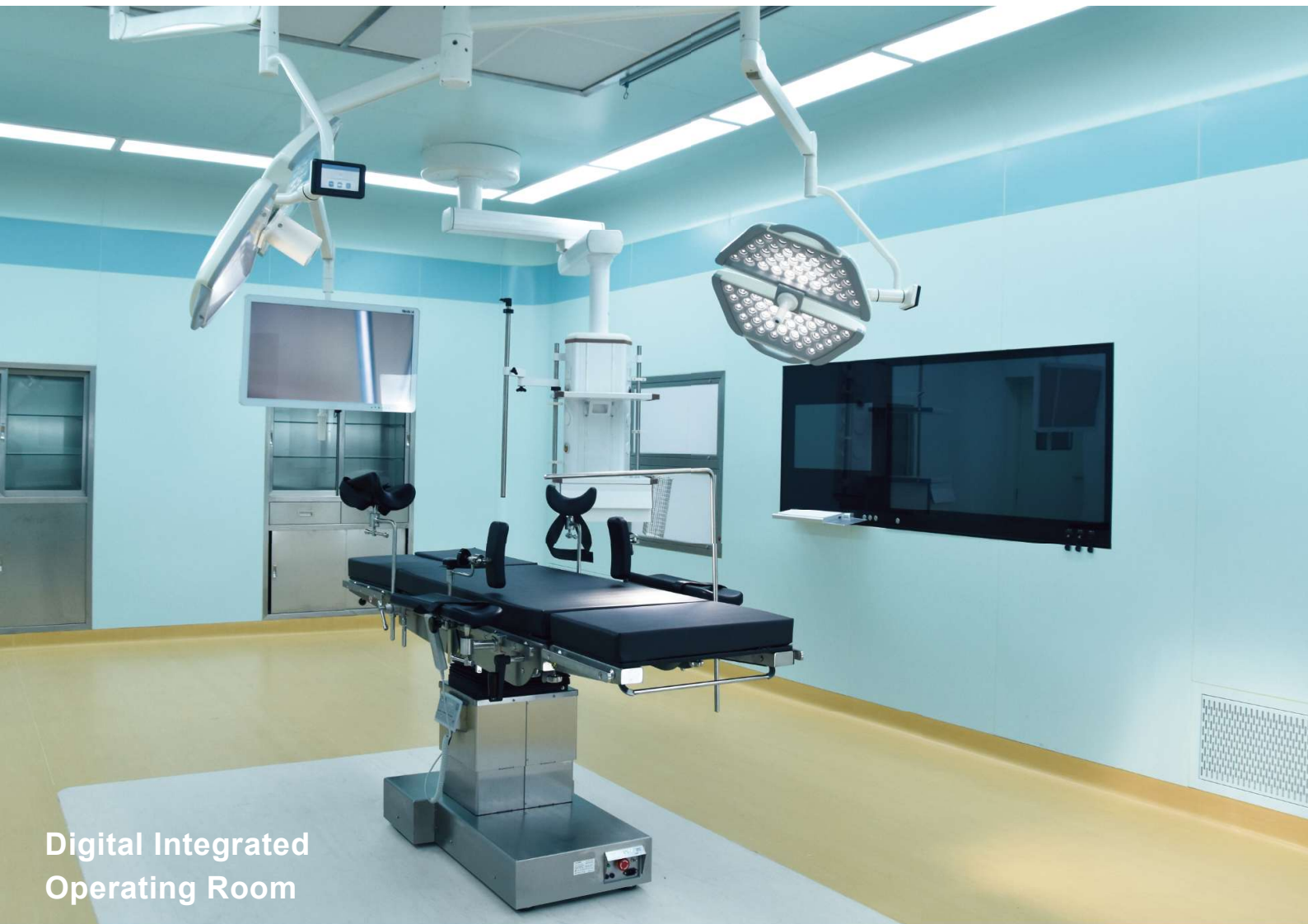
Digital Integrated Operating Room