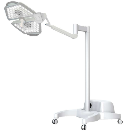
PANALEX 1 mobile