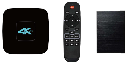
Recorder Remote control Mobile disk

Monitor size: 21.5", 24", 27", 32", 55", 65" is optional